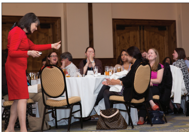
Gloria Feldt presents at the 2014 CWBA Convention.

GF: The power of the purse drives almost everything, In addition to shaping consumer products; organizations like Women Moving Millions are massing women's philanthropic clout by enlisting members to commit $1 million over five years to organizations that help women and girls. They don't tell you what to fund, but by virtue of their mission they can have enormous clout to influence policy as well as programs. Similarly, gender lens investing can put our investments with companies that