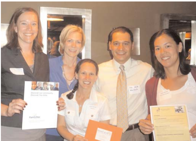
Representatives of The Gathering Place, Family Star, and WeeCycle at the CWBA's April 26, 2012 Baby Shower.