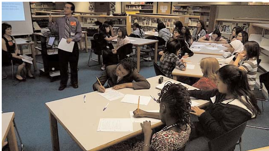
Students at Aurora Hills Middle School participating in the “Smart Girls” program.