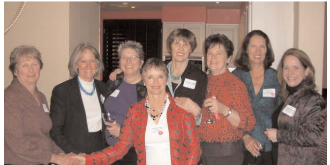
February 9, 2011 CWBA Foundation Leadership Circle Reception.