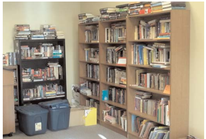
CWBA Book Drive to Benefit CWEE (Prior to the Book Drive, all the CWEE library had was in the small black bookshelf.)